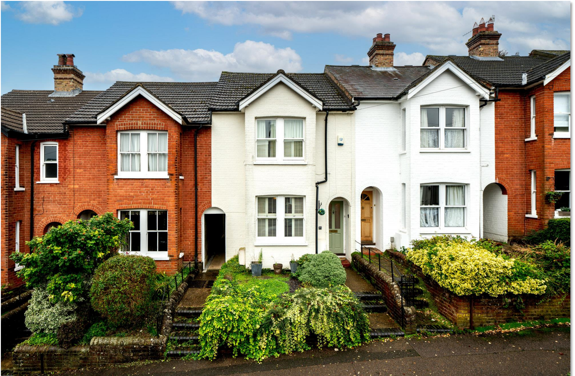
Shrublands Avenue, Berkhamsted HP4 3JG