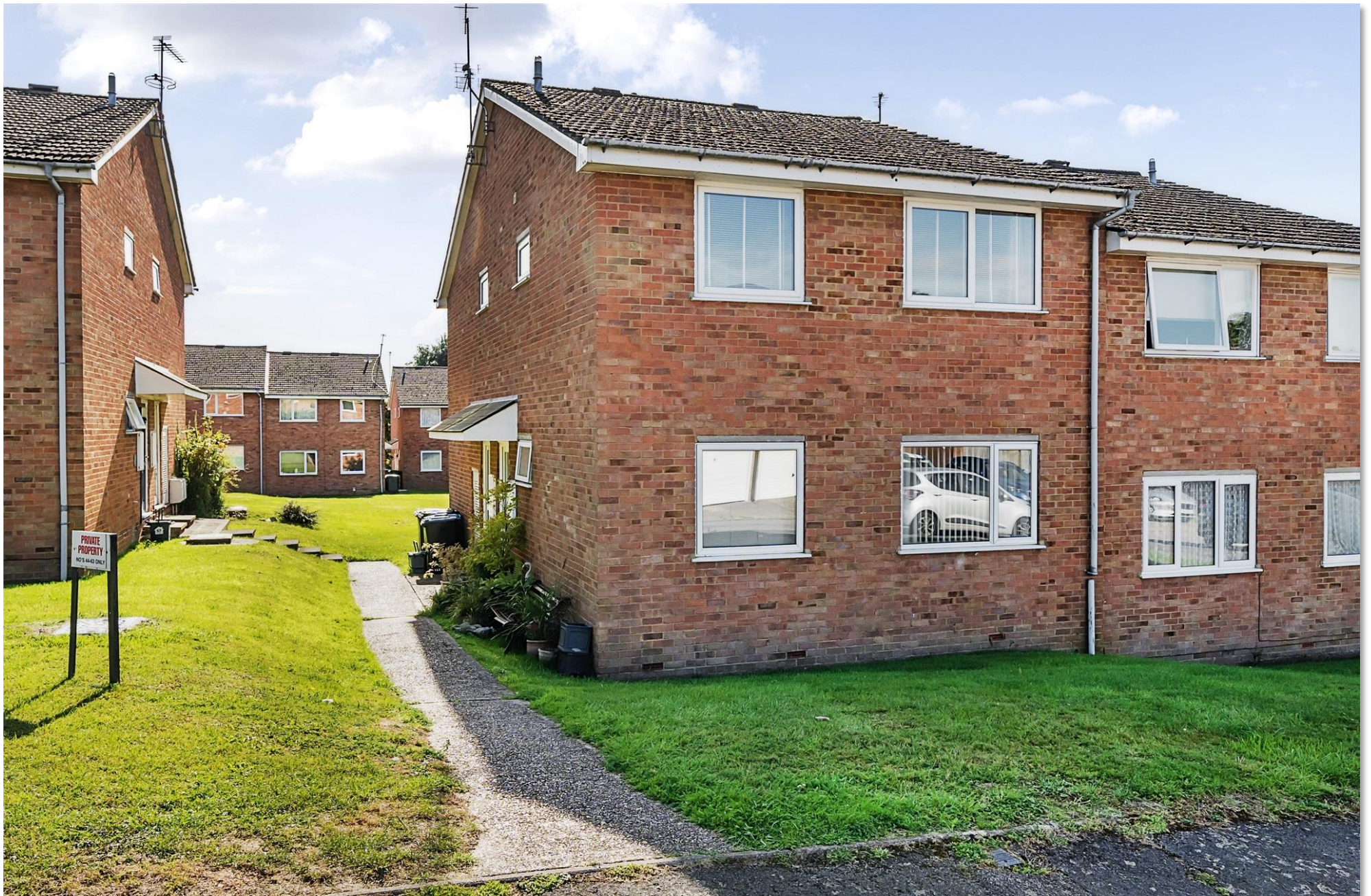
Chiltern Park Avenue, Berkhamsted HP4 1EX