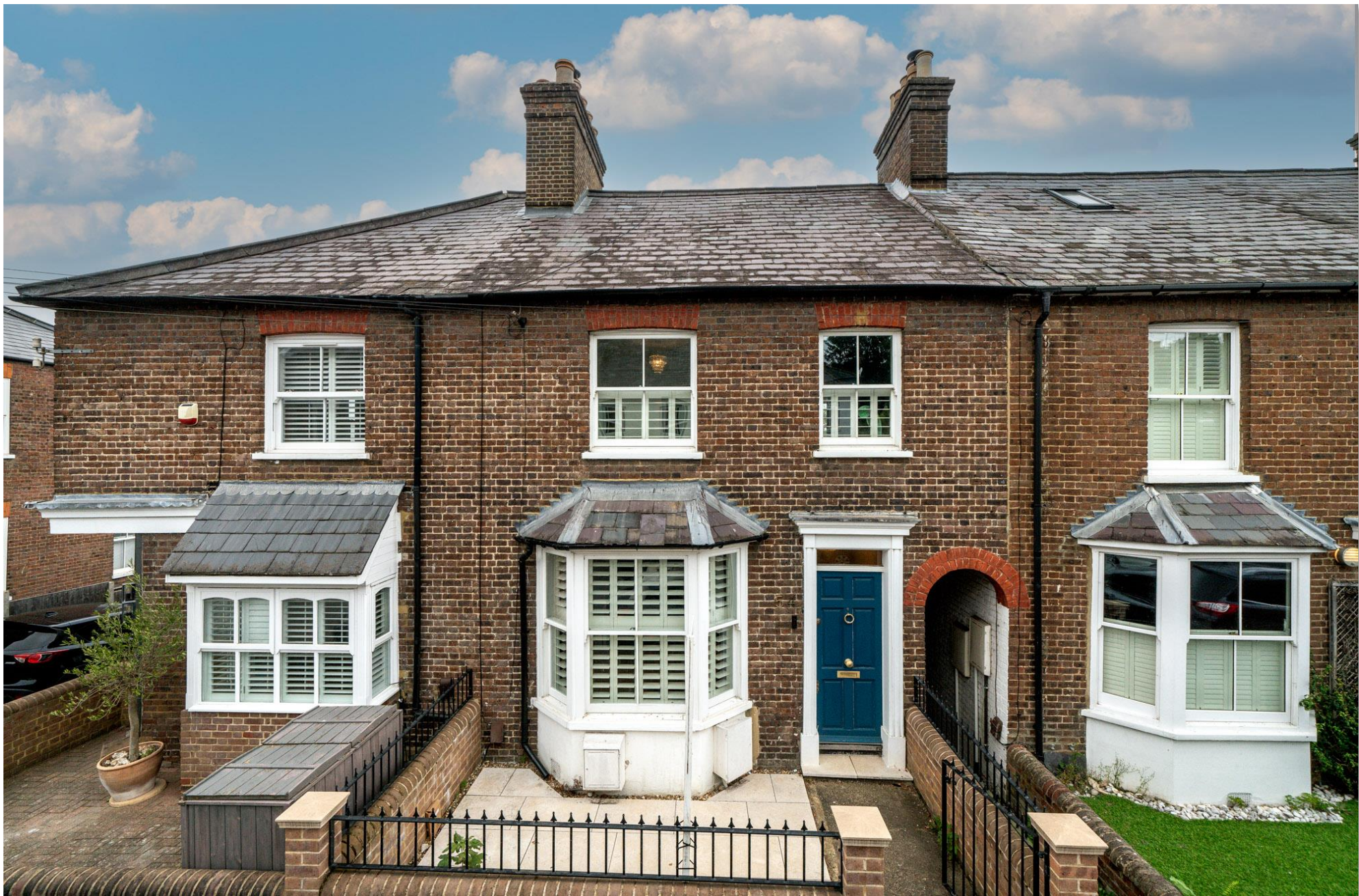
Charles Street, Berkhamsted HP4 3DJ