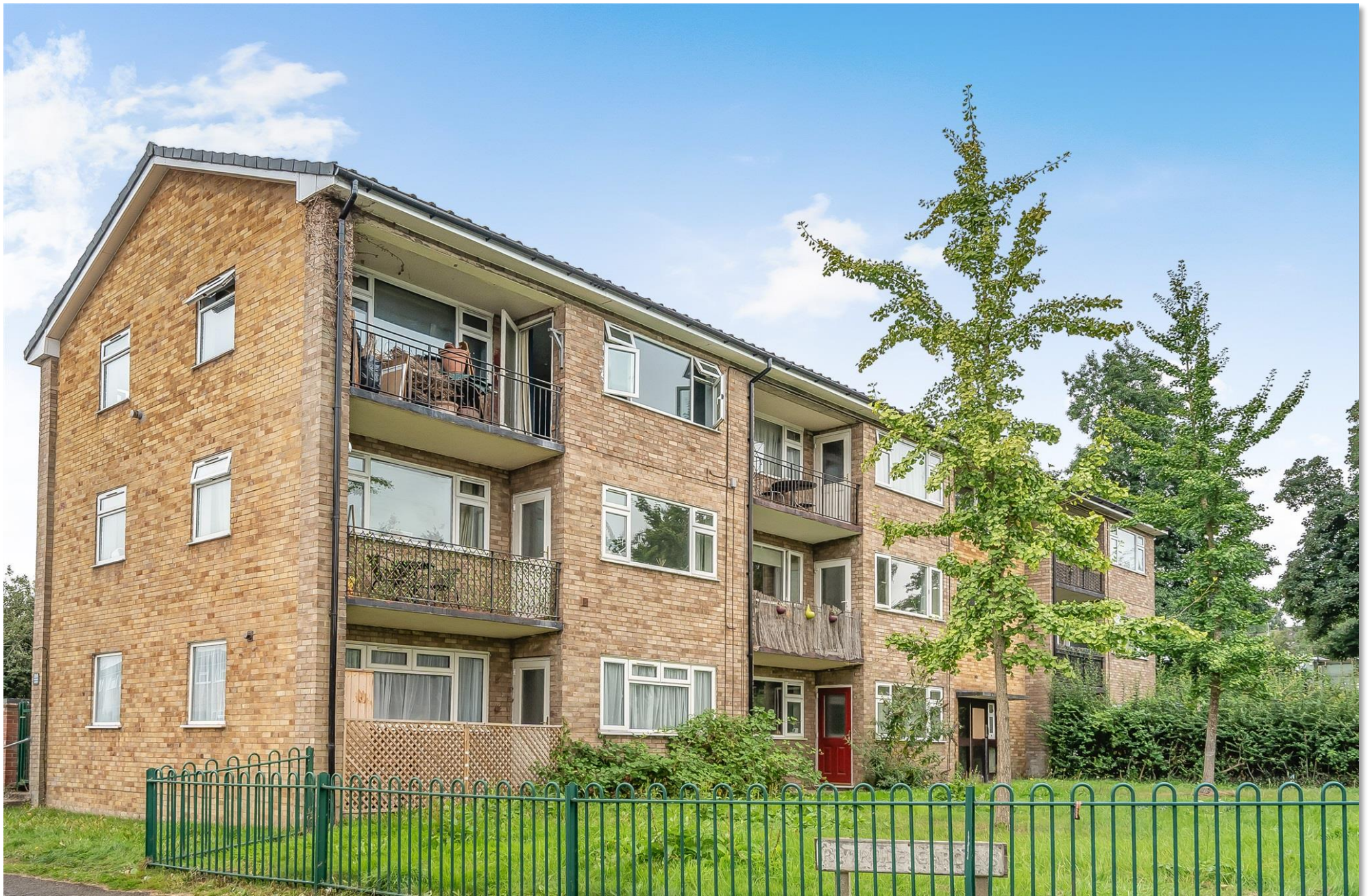
Riverside Gardens, Berkhamsted HP4 1DN