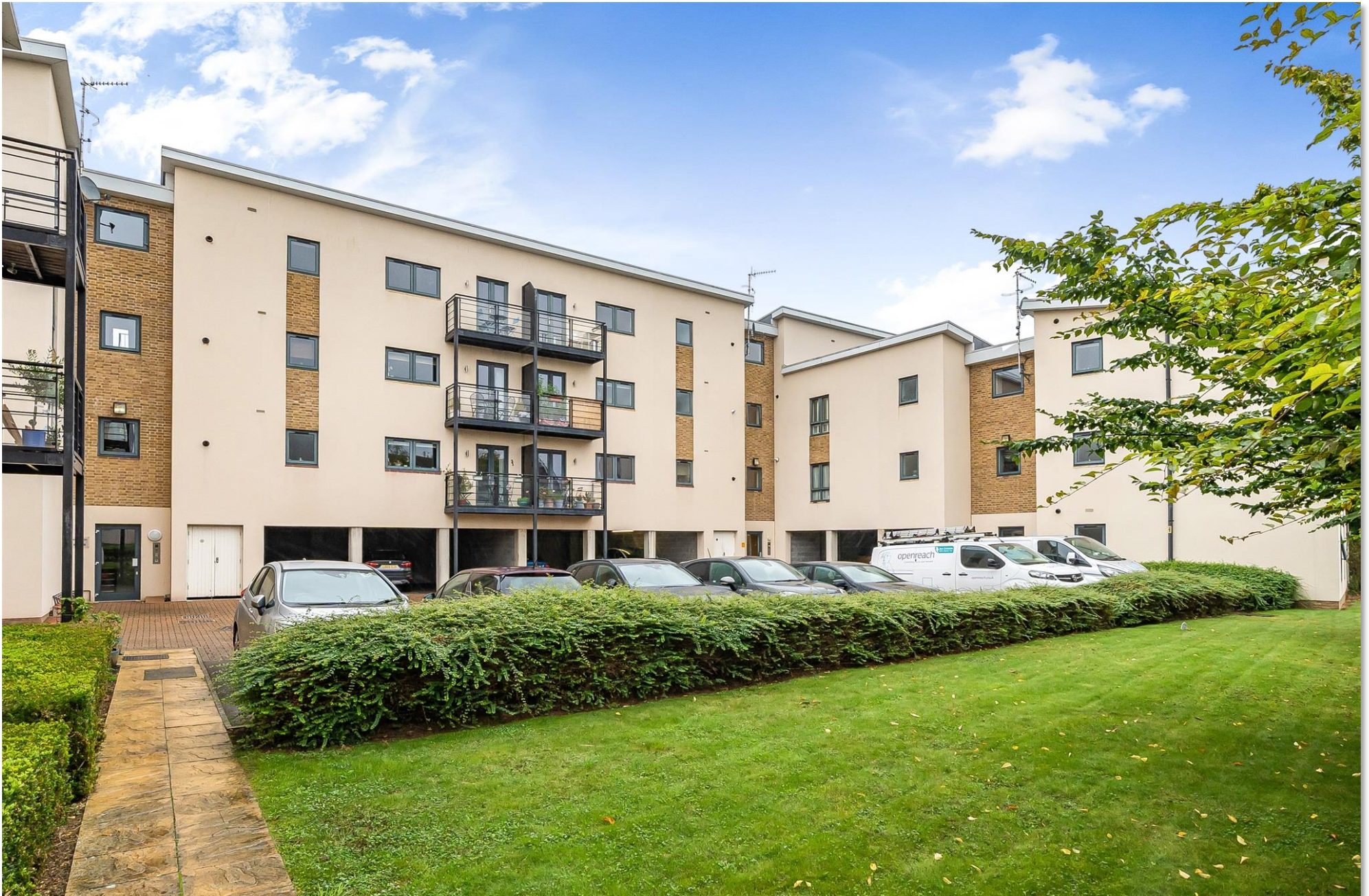
Birtchnell Close, Berkhamsted HP4 1FE