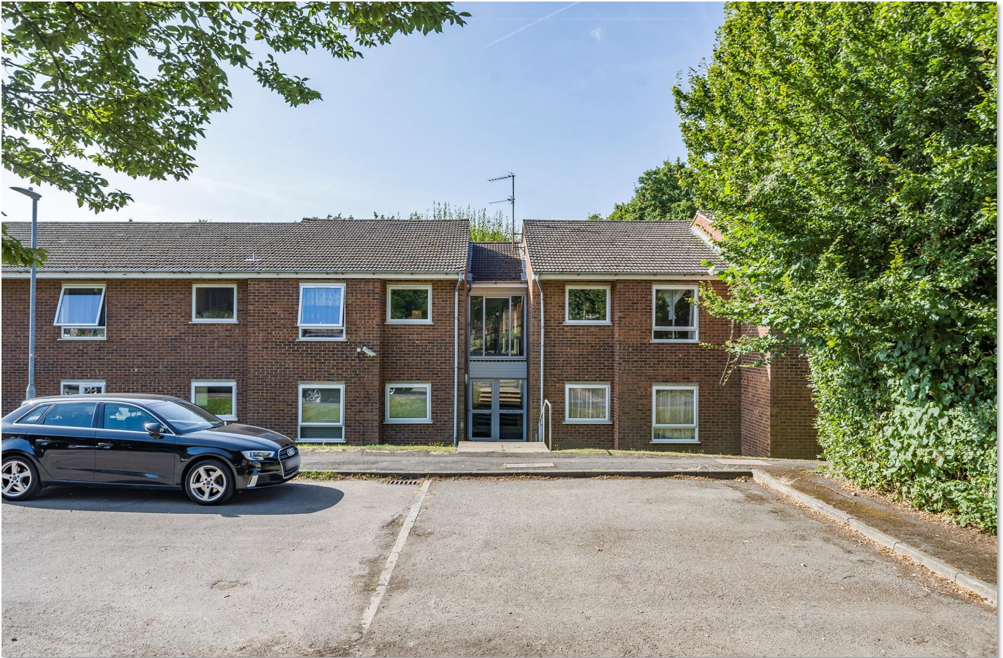
Chiltern Park Avenue, Berkhamsted HP4 1EZ