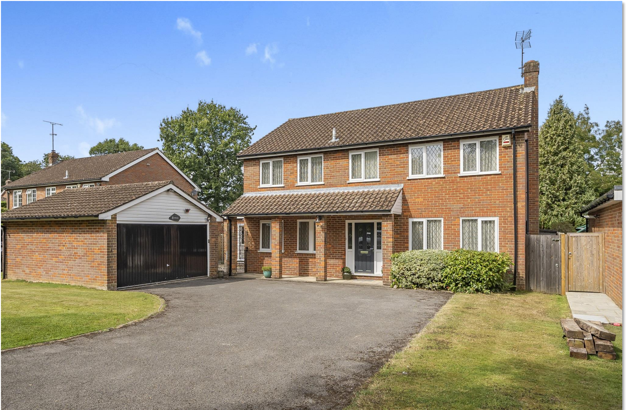
The Laurels, Potten End Berkhamsted HP4 2SP