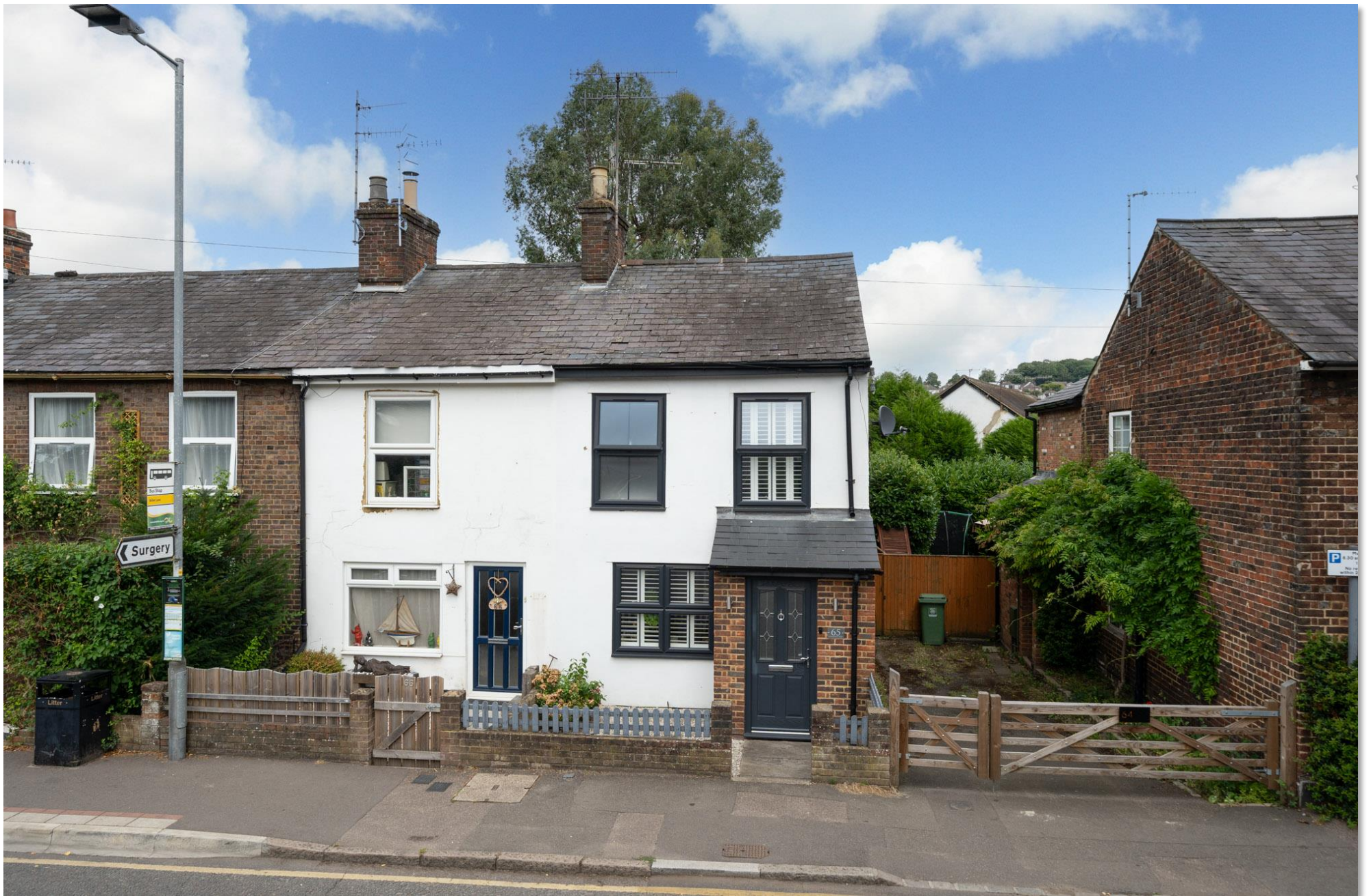
Gossoms End, Berkhamsted HP4 1DJ