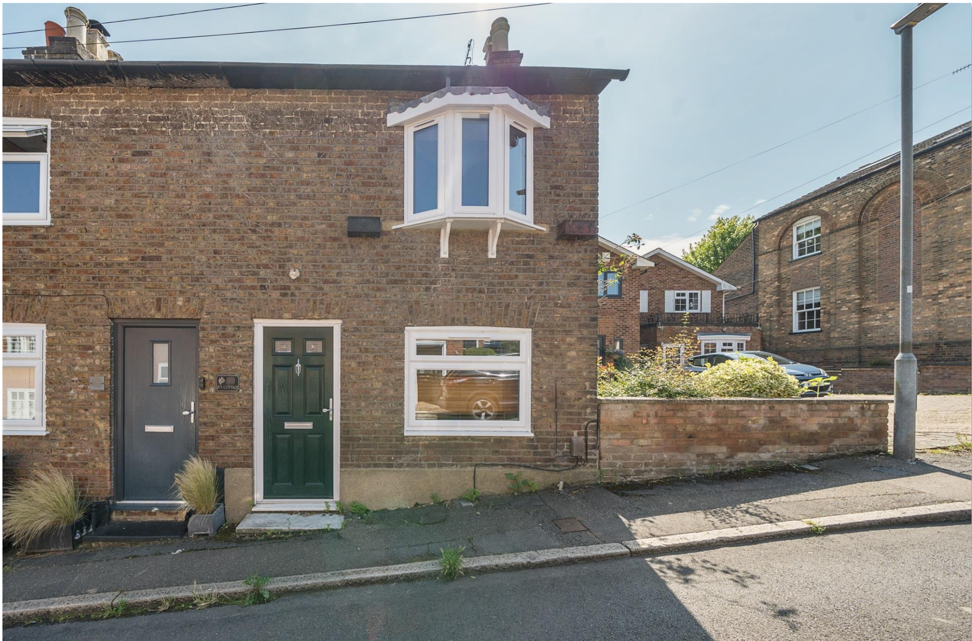
Highfield Road, Berkhamsted HP4 2DA