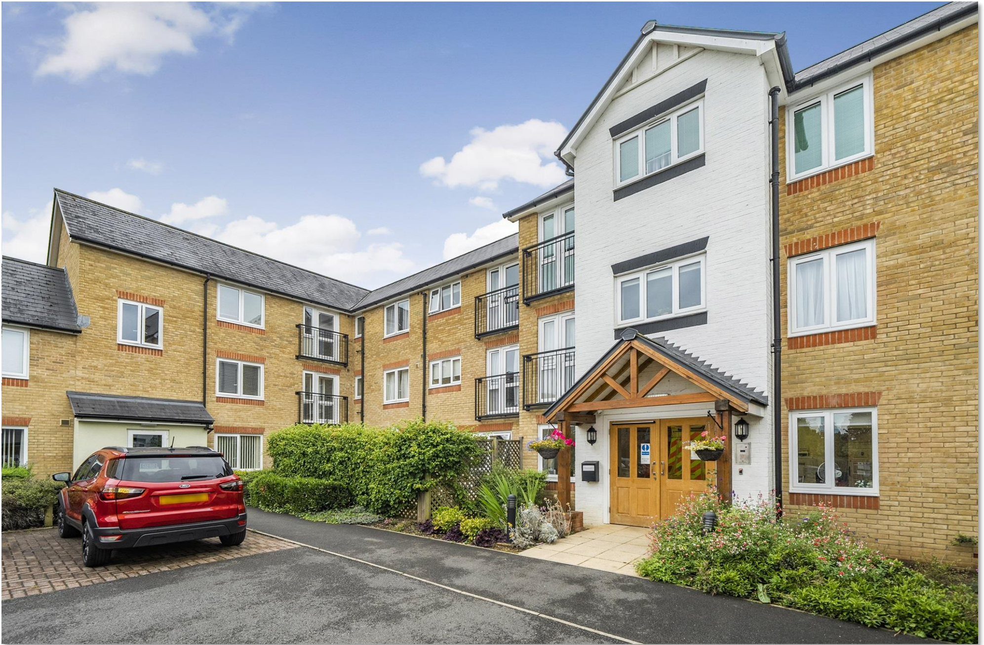
Sheldon Lodge High Street, Berkhamsted HP4 1FP