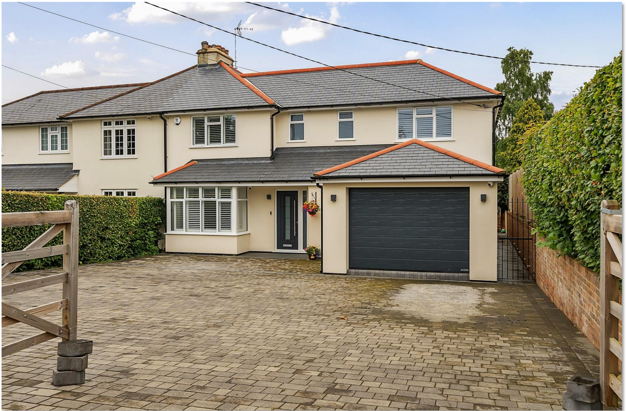
The Green, Potten End Berkhamsted HP4 2QH