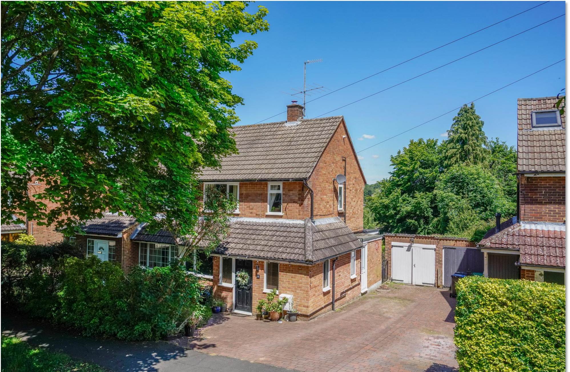
St Margarets Close, BERKHAMSTED HP4 2LH