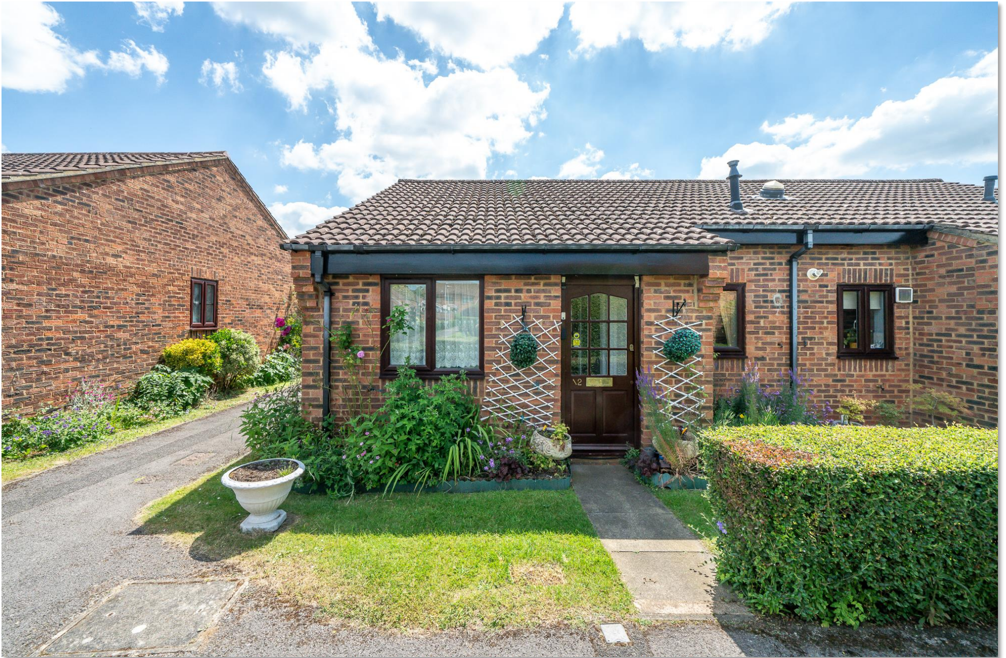
Mandelyns, Northchurch Berkhamsted HP4 3XH