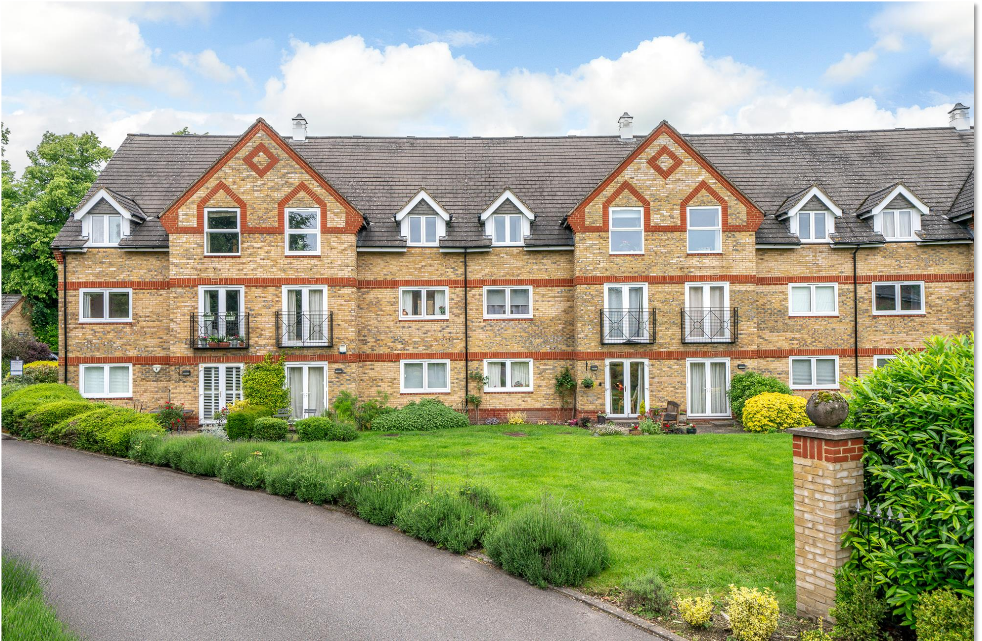
Greenes Court Lower Kings Road, Berkhamsted HP4 2JU