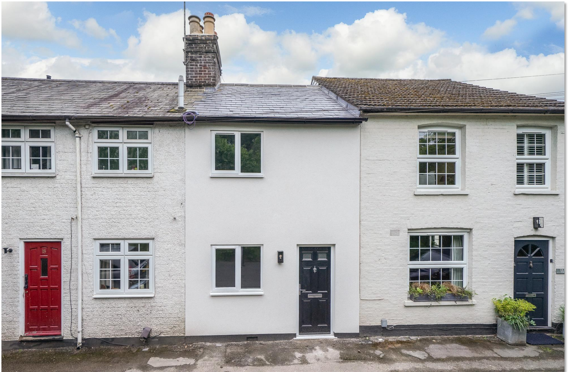
Ellesmere Road, Berkhamsted HP4 2EX