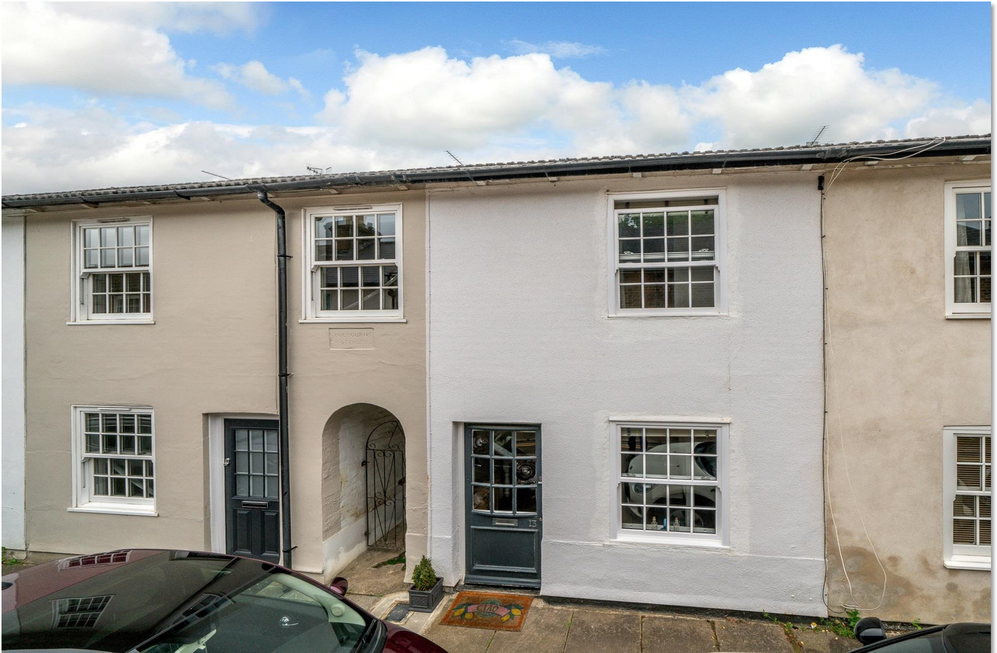
Bridge Street, Berkhamsted HP4 2EB