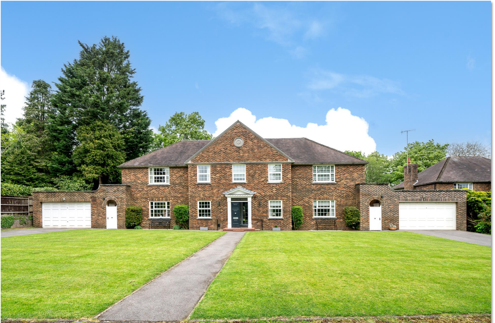
Raglan House Kilfillan Gardens, Berkhamsted HP4 3LU