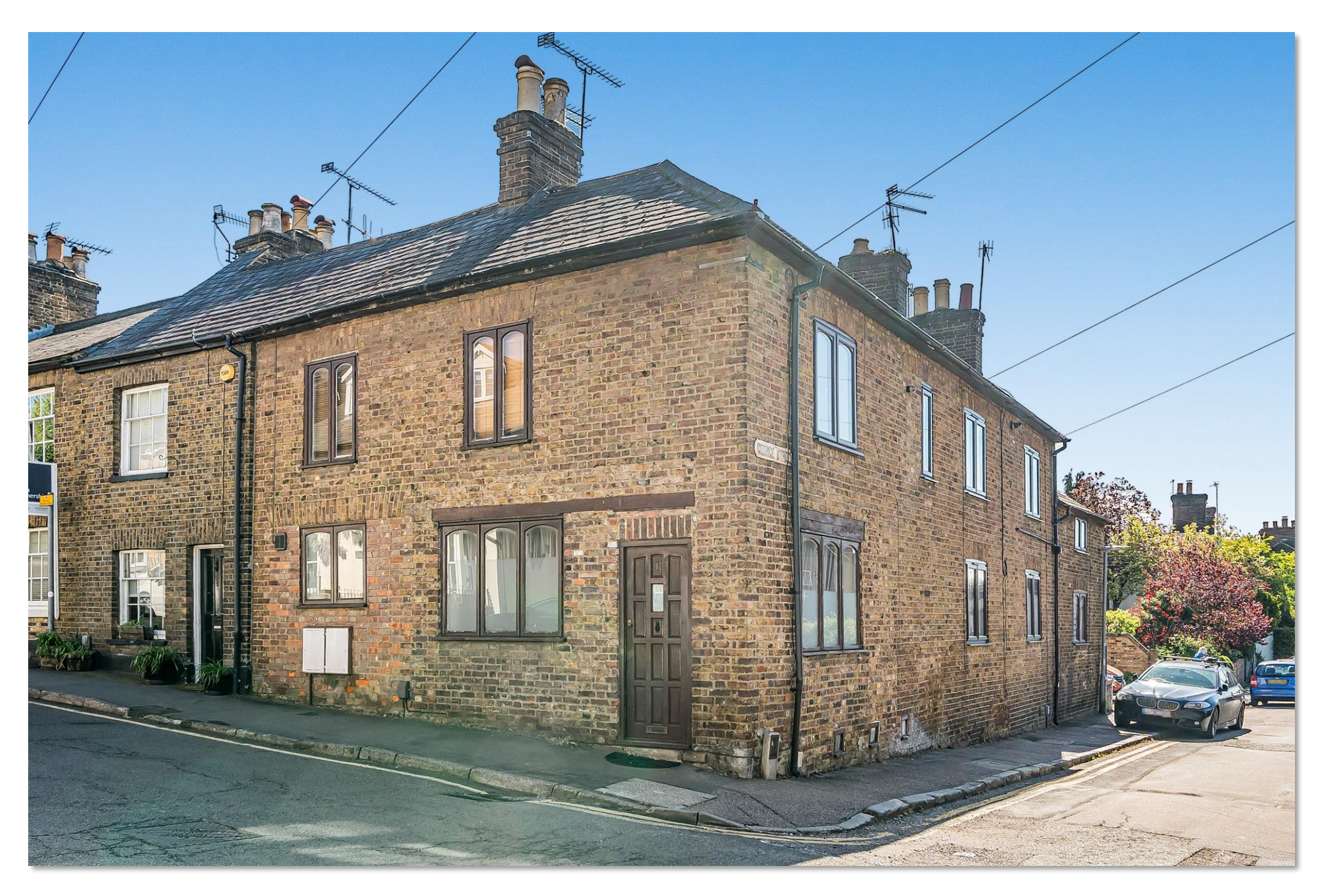
The Mews Gravel Path, Berkhamsted HP4 2EF