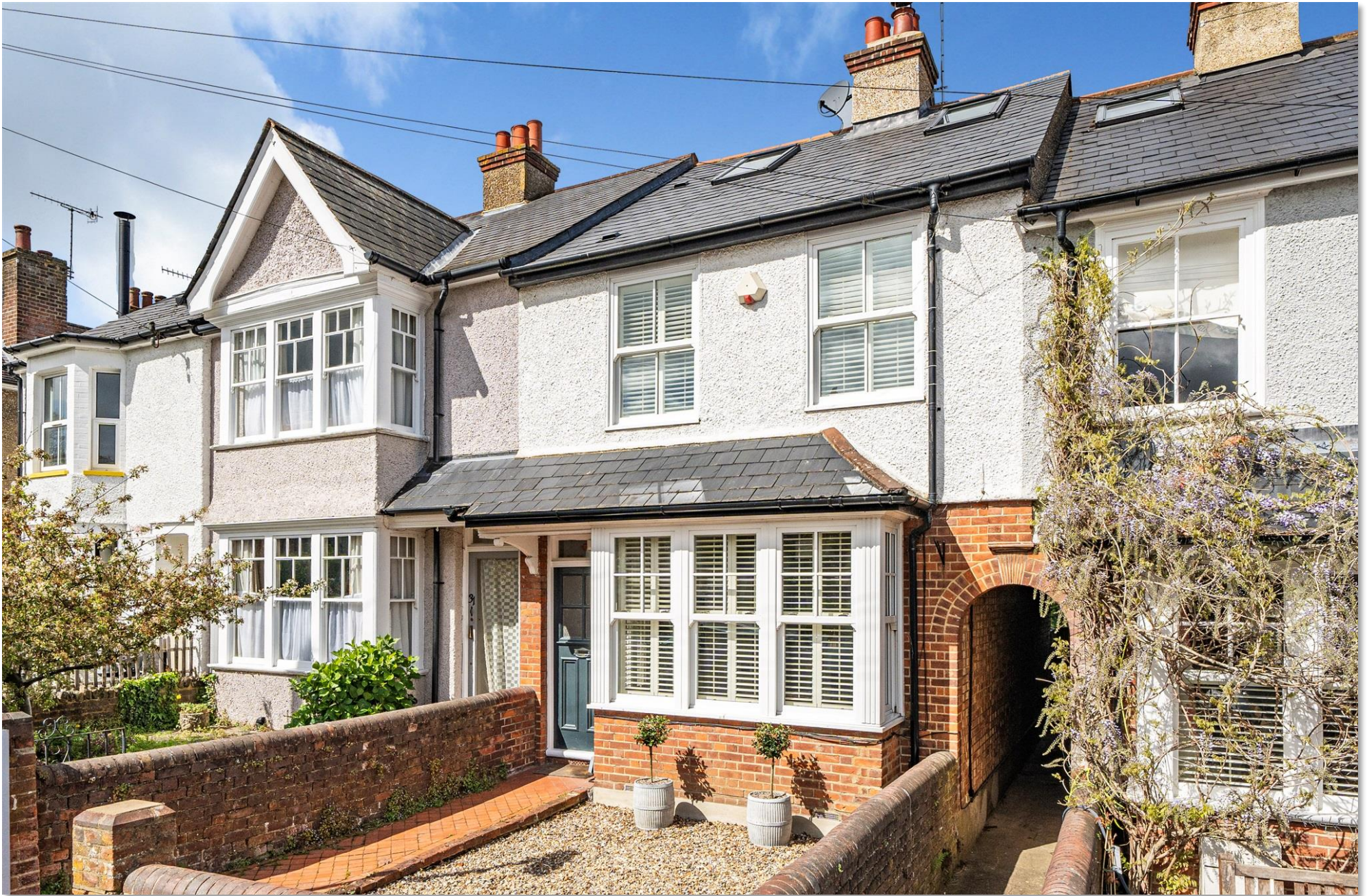
Queens Road, BERKHAMSTED HP4 3HU