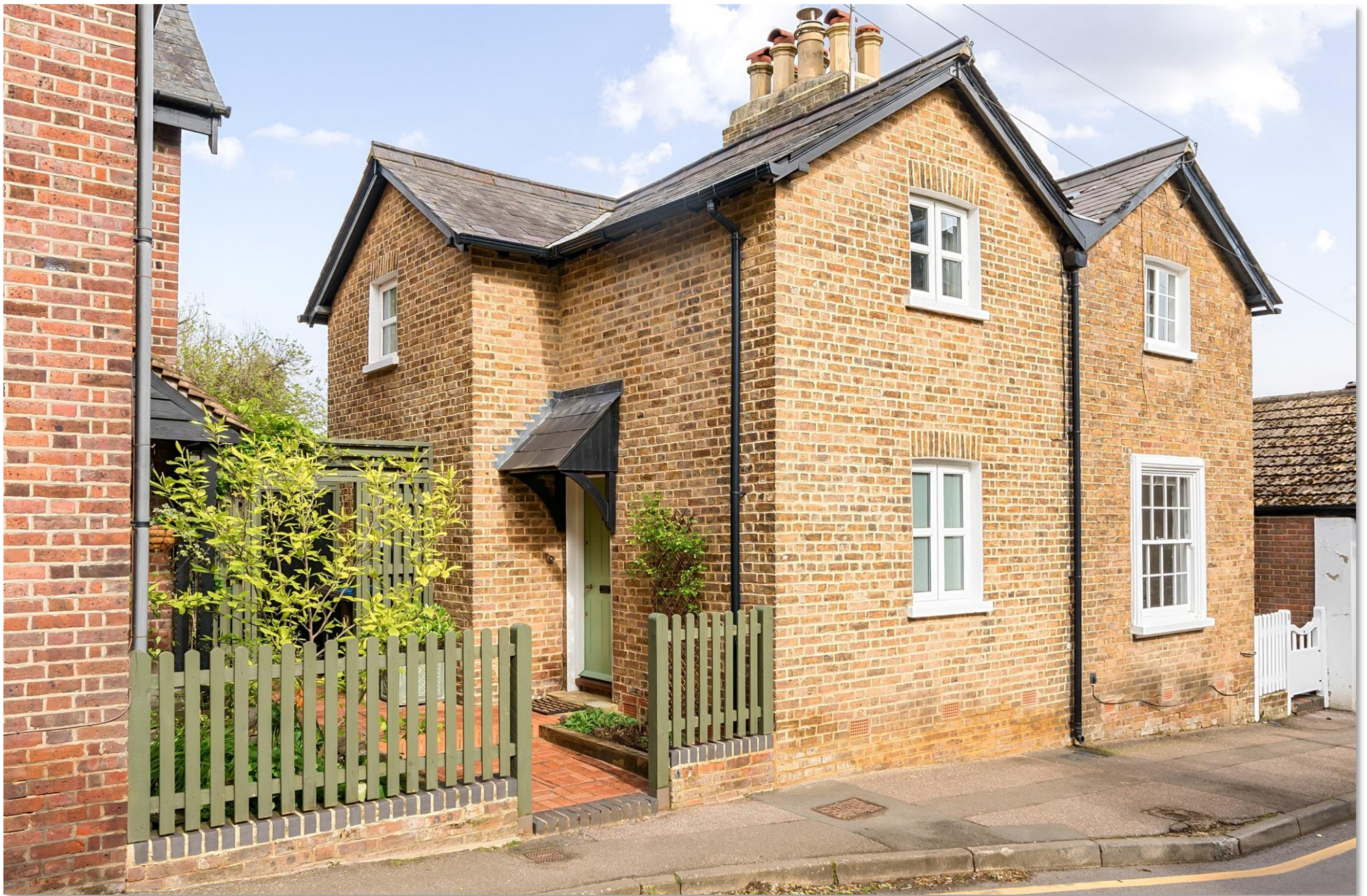
Chesham Road, Berkhamsted HP4 3AA