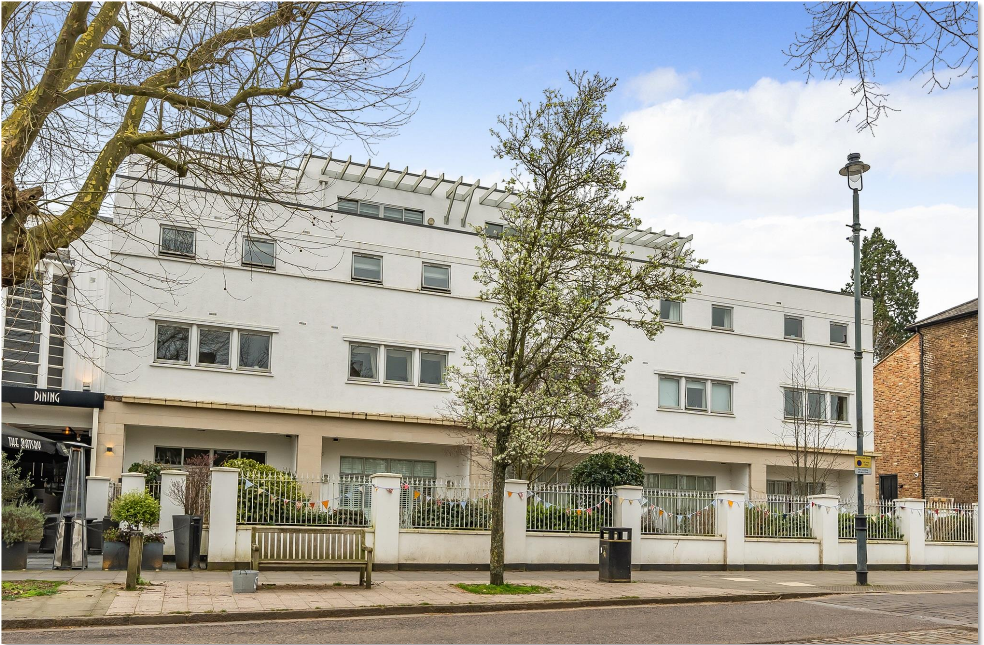
The Rex High Street, Berkhamsted HP4 2BT