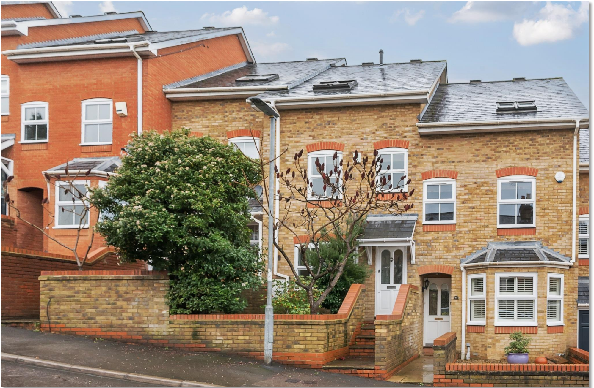
Cross Oak Road, Berkhamsted HP4 3HZ