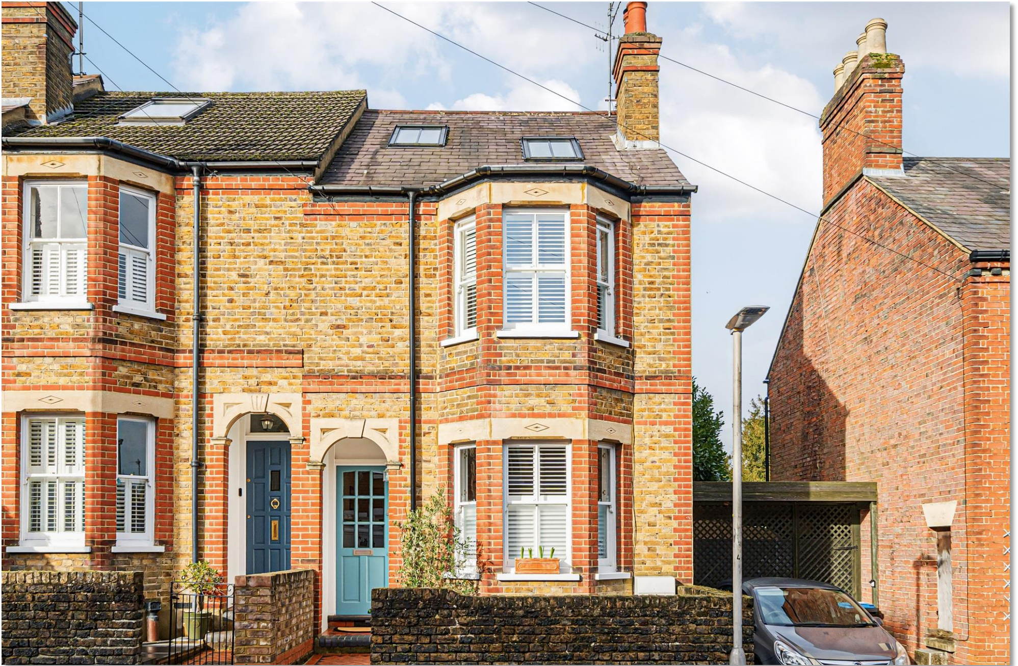
Victoria Road, Berkhamsted HP4 2JT