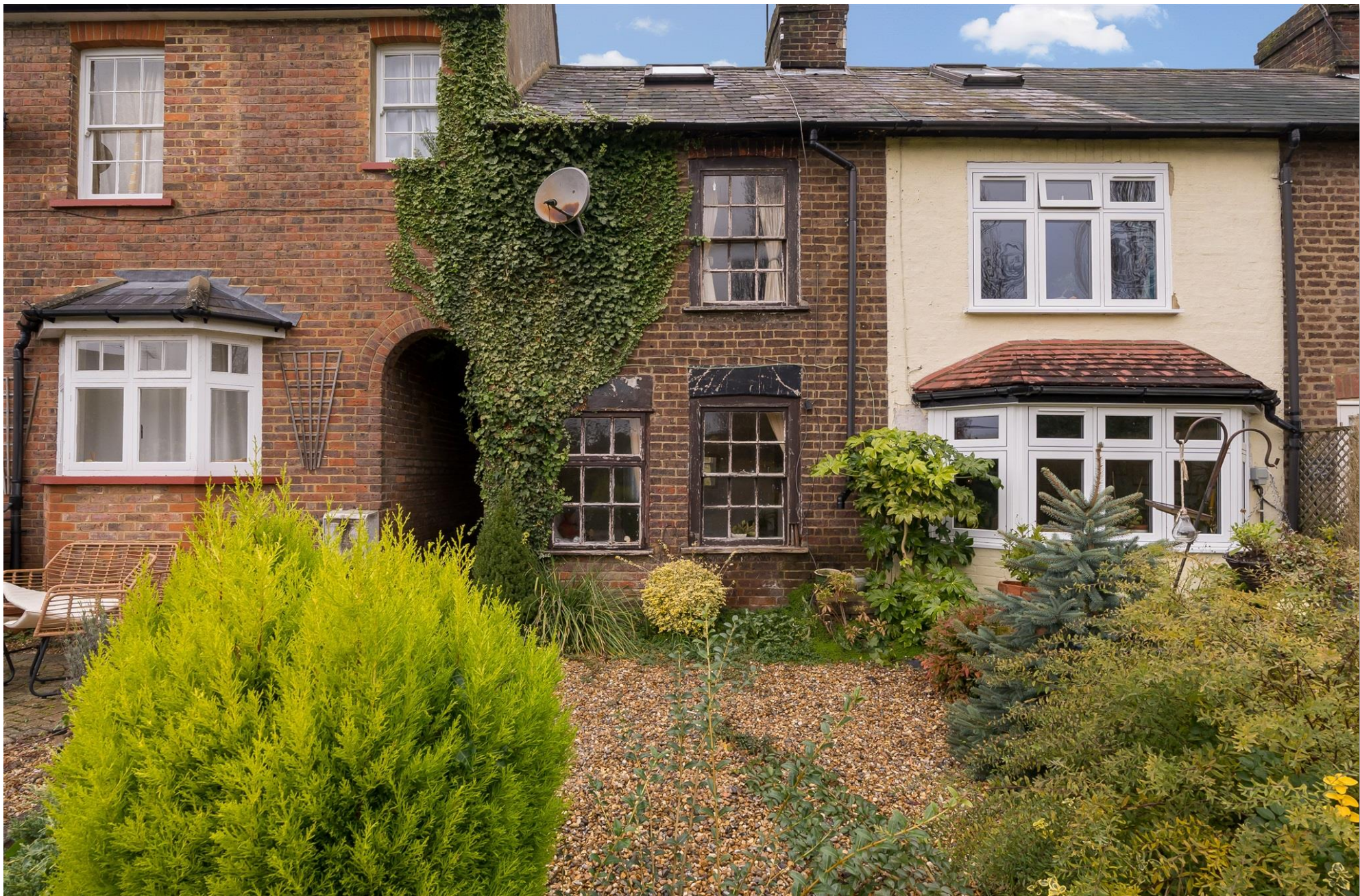
Nursery Terrace, Potten End Berkhamsted HP4 2QU