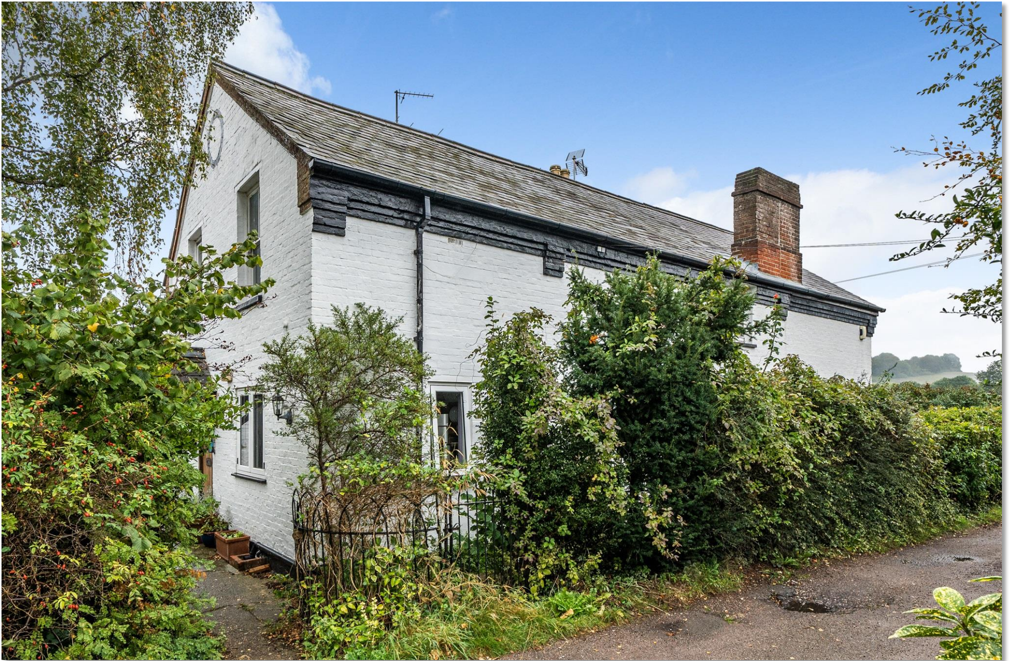
Malting Lane, Dagnall Berkhamsted HP4 1QY