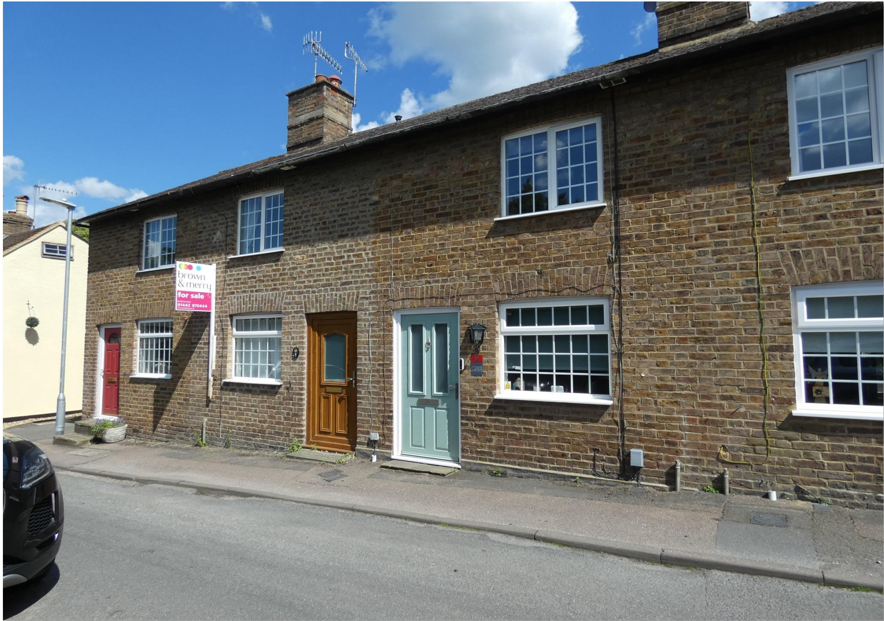
Bell Lane, Northchurch Berkhamsted HP4 3RD