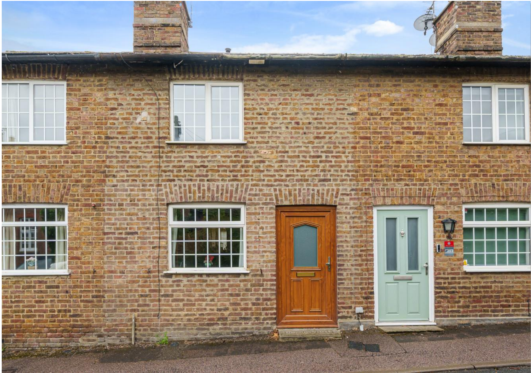
Bell Lane, Northchurch Berkhamsted HP4 1DJ