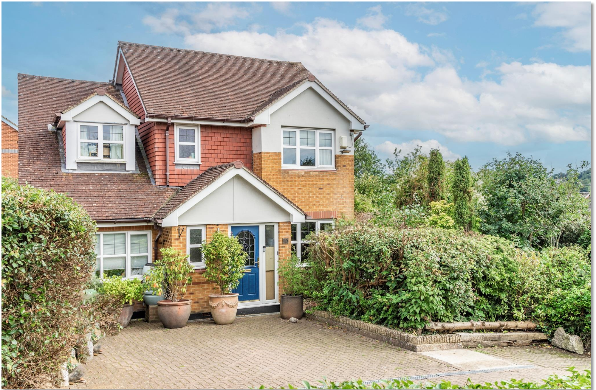
Emperor Close, Berkhamsted HP4 1TD