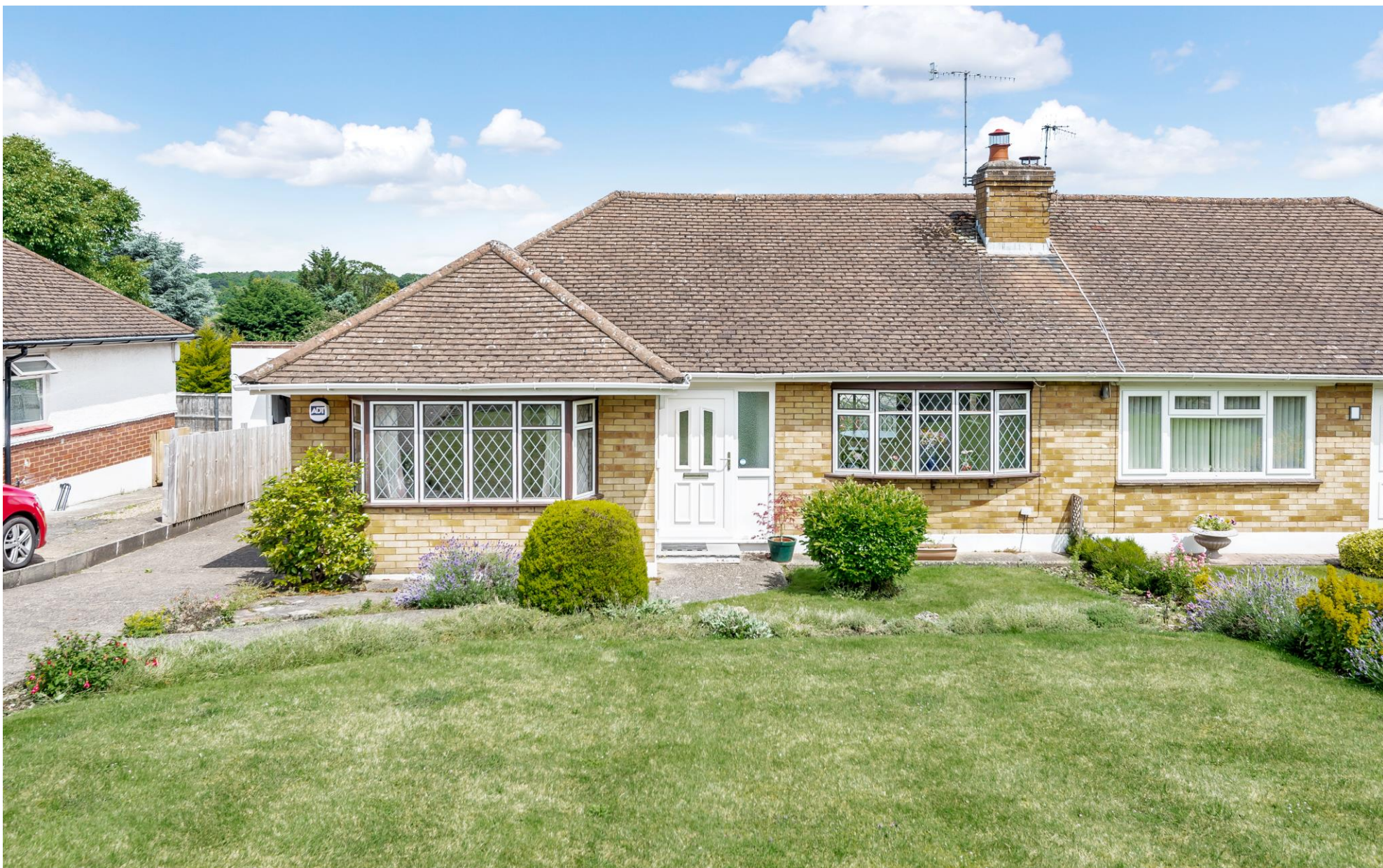
Covert Road, Northchurch, Berkhamsted, HP4 3RR