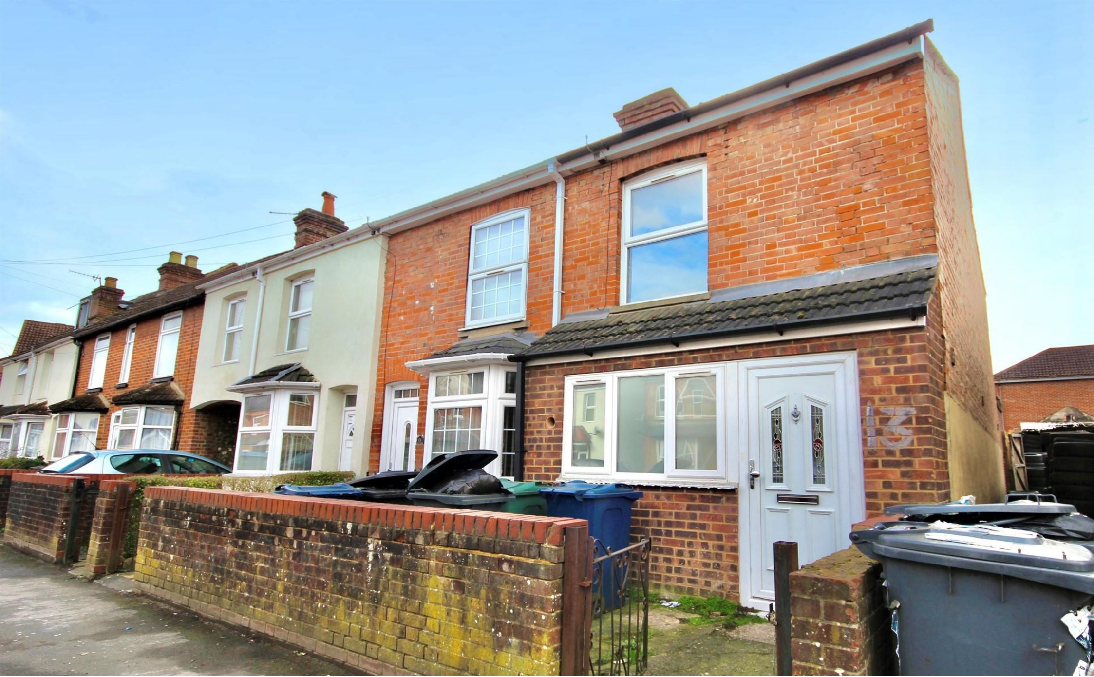
Abercromby Avenue, High Wycombe, HP12 3AX