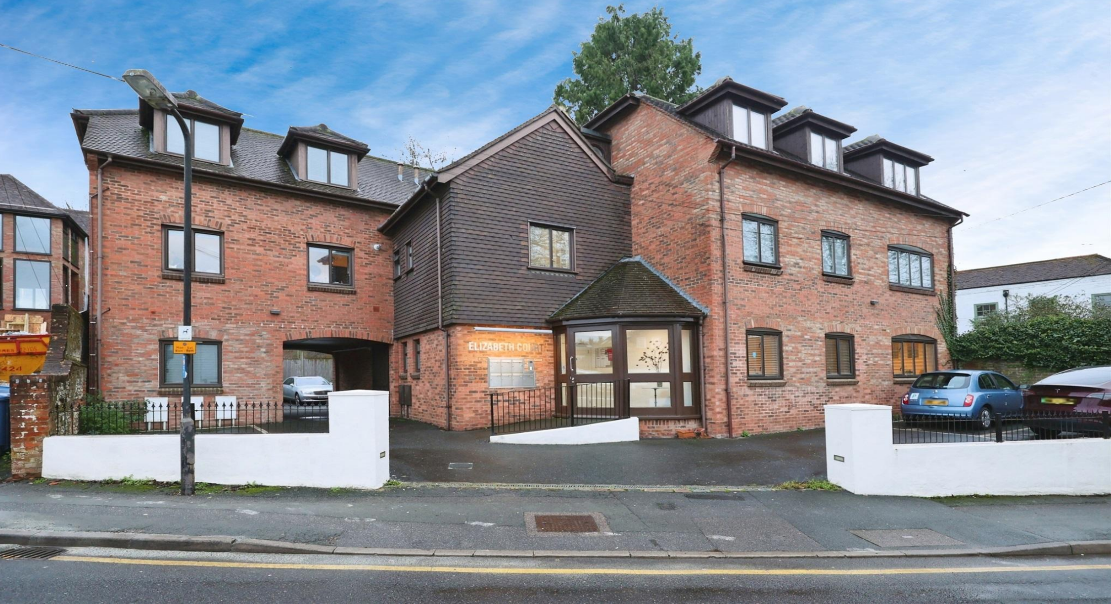
Elizabeth Court East Street, Chesham HP5 1DG