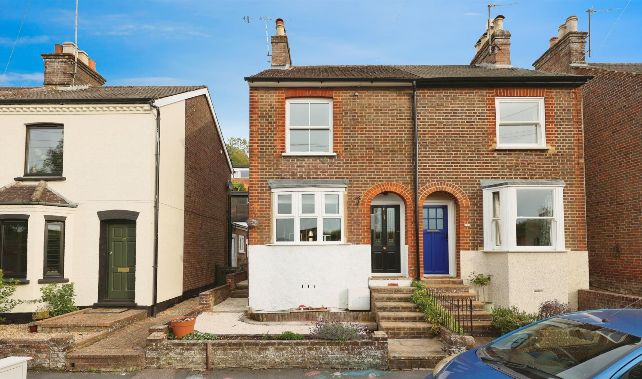
Kirtle Road, Chesham HP5 1AD