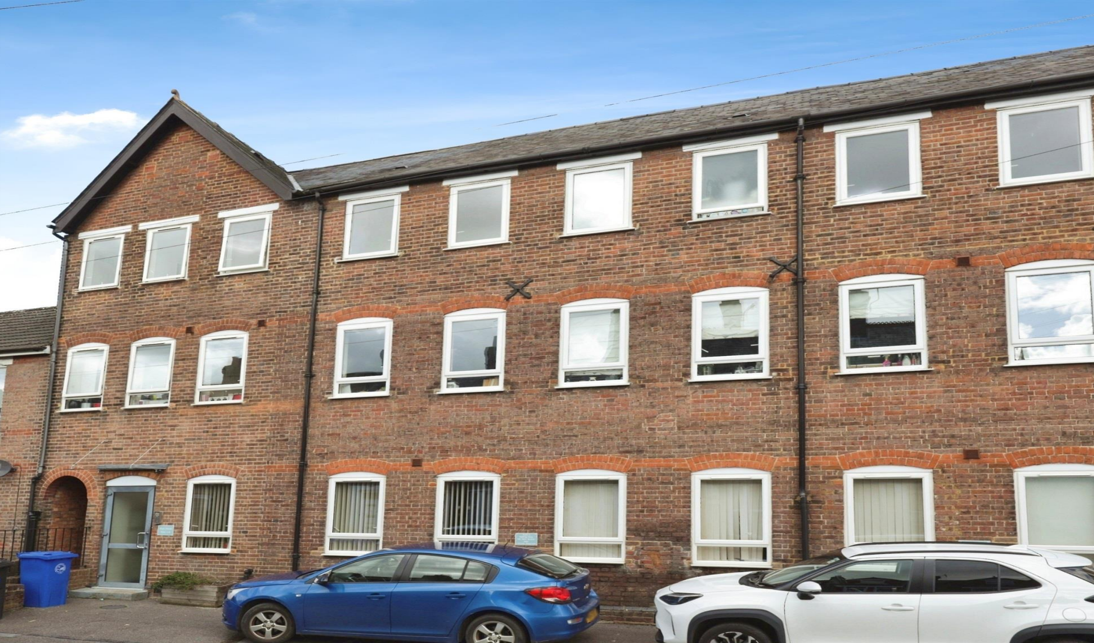
Buck House, Sunnyside Road, Chesham HP5 2AR