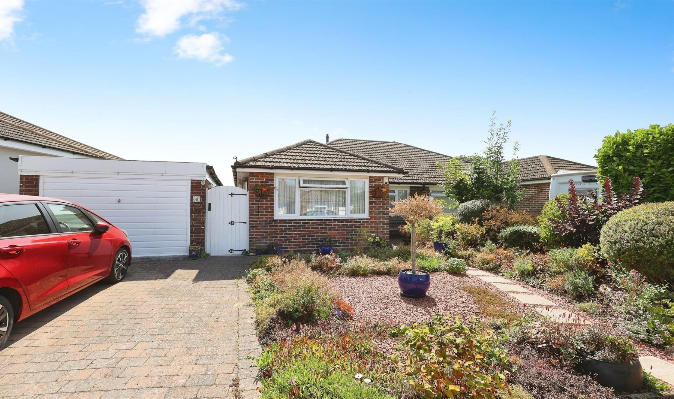
Crabbe Crescent, Chesham HP5 3DD