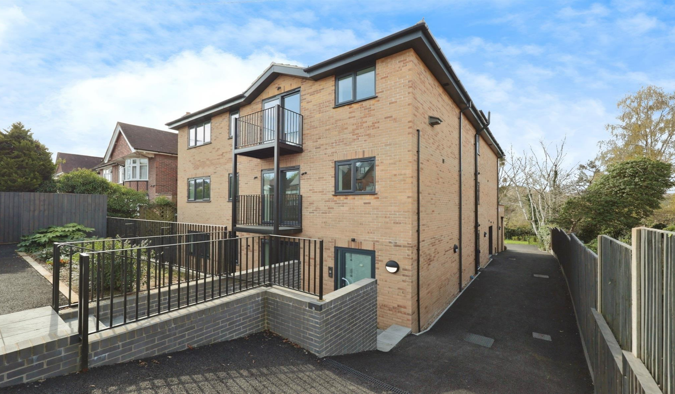
Flat 3 West Wycombe Road, High Wycombe HP12 3AS