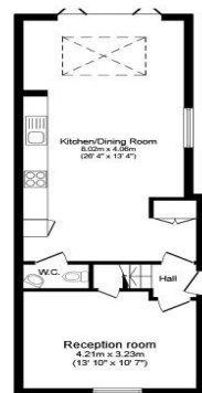
Ground Floor Floor area 49.8 m 2 (536 sq.ft.) approx

Total floor area 150.8 m 2 (1,624 sq.ft.) approx