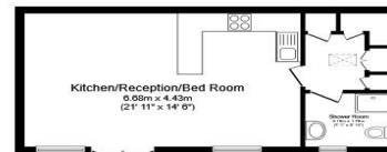
Outbuilding Floor area 39.6 m 2 (426 sq.ft.) approx