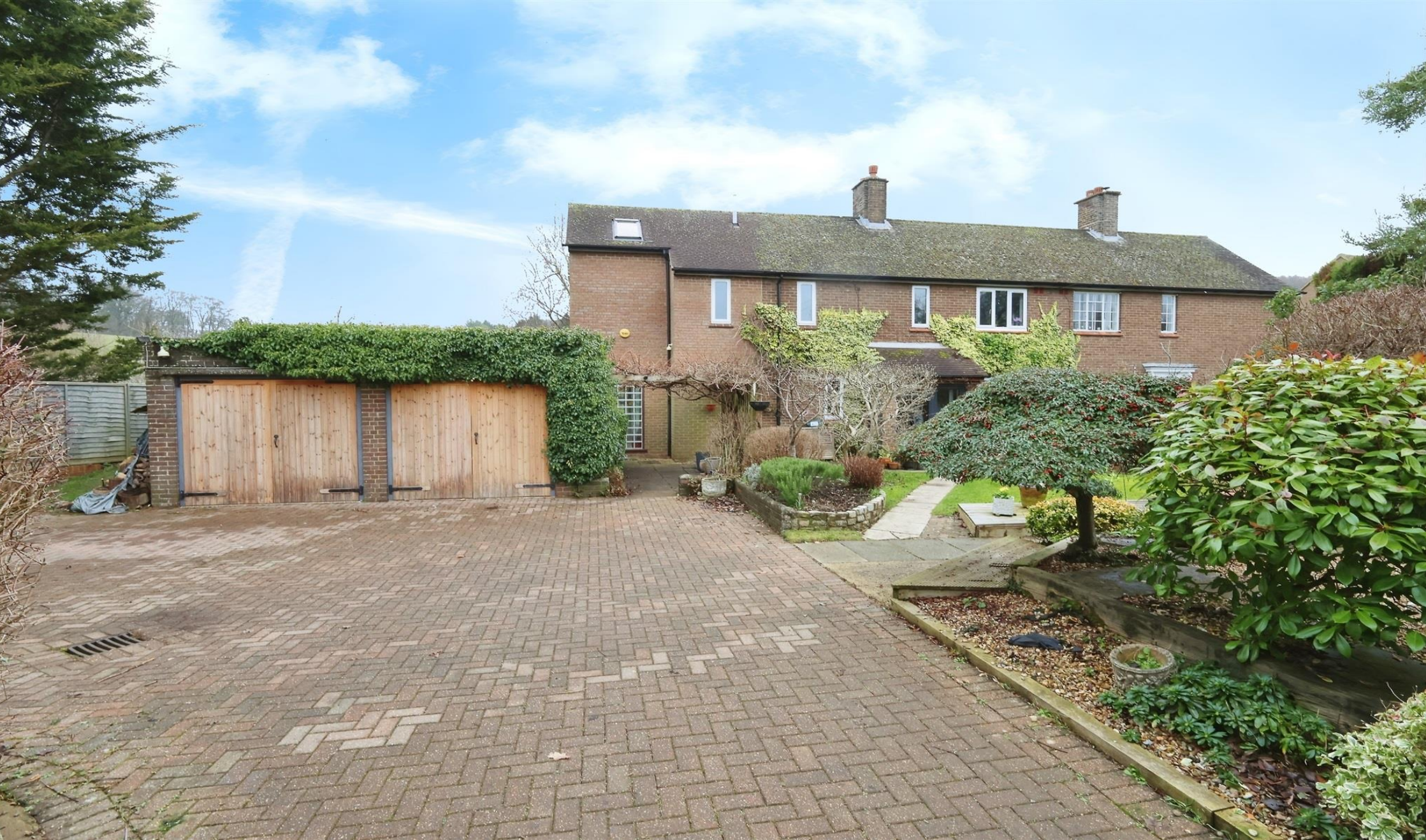
The Vale, Hawridge Chesham HP5 3NY