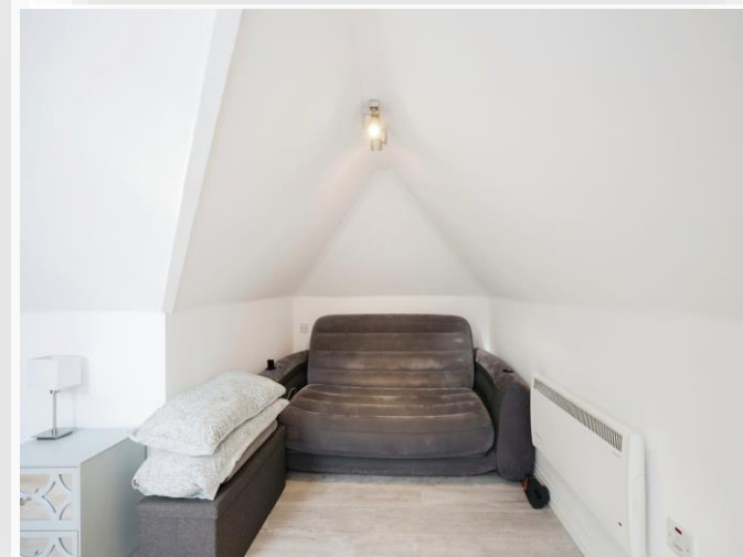
Copsham House, Broad Street, Chesham HP5 3EA