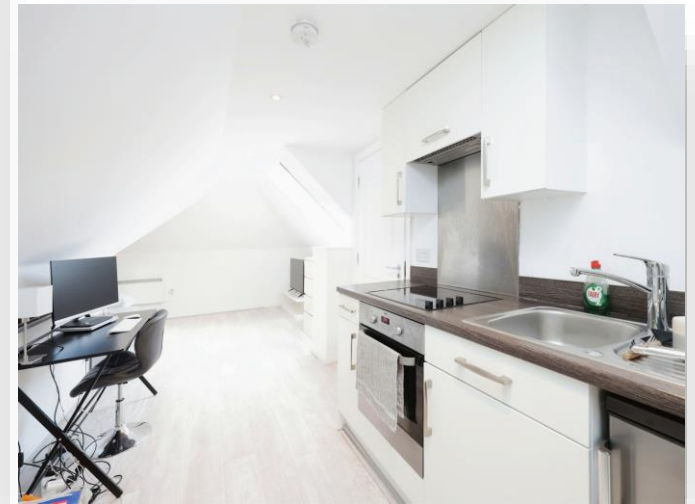
Copsham House Broad Street, Chesham HP5 3EA