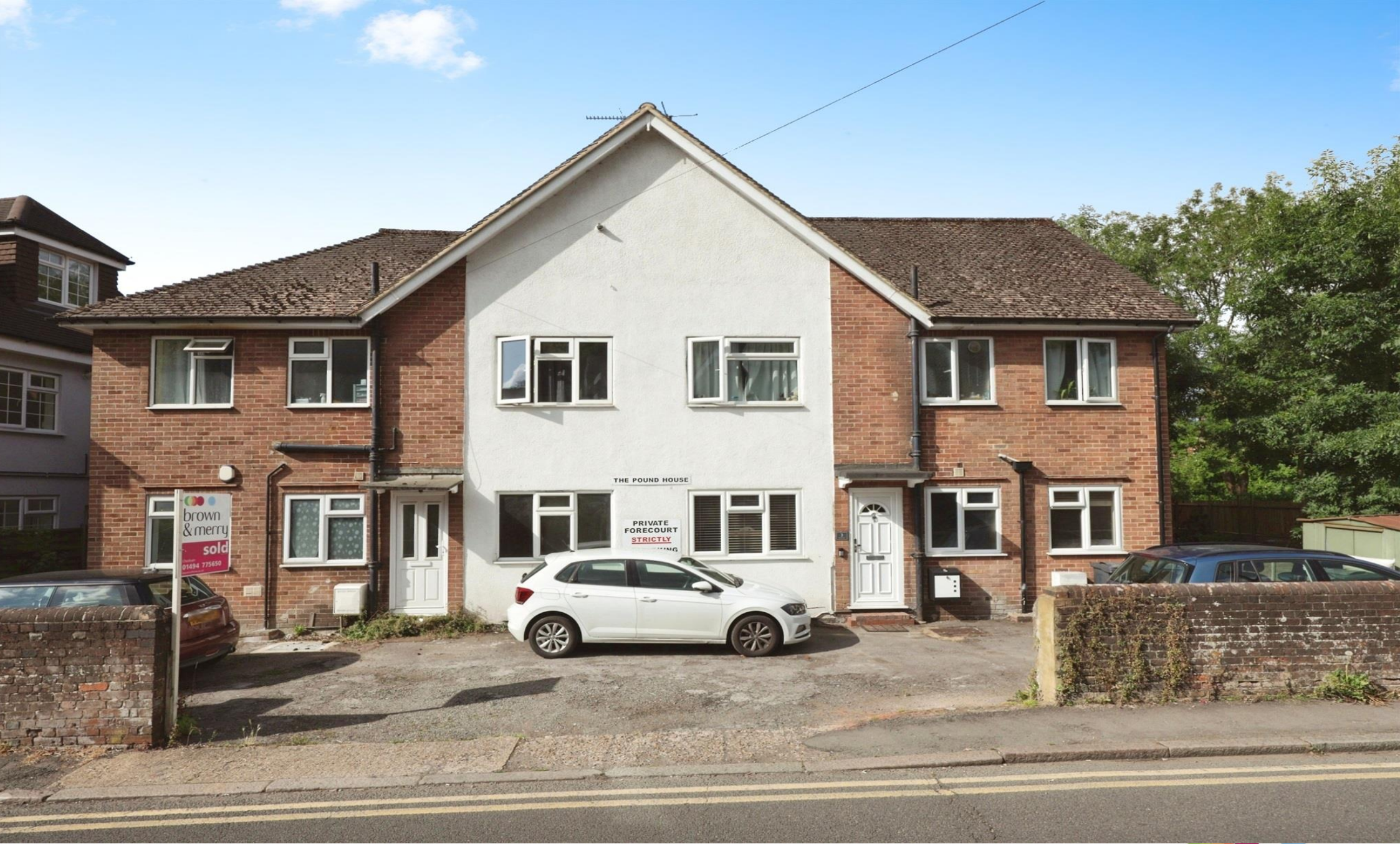
The Pound House, Waterside, Chesham HP5 1PD