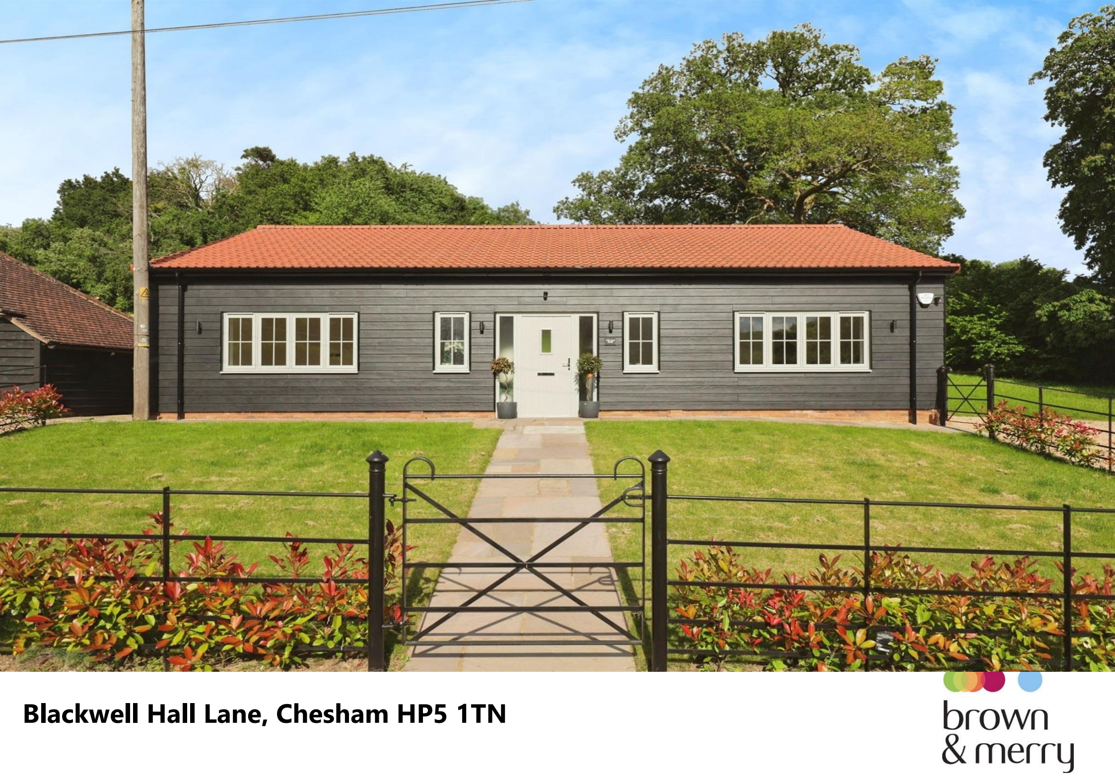
Blackwell Hall Lane, Chesham HP5 1TN