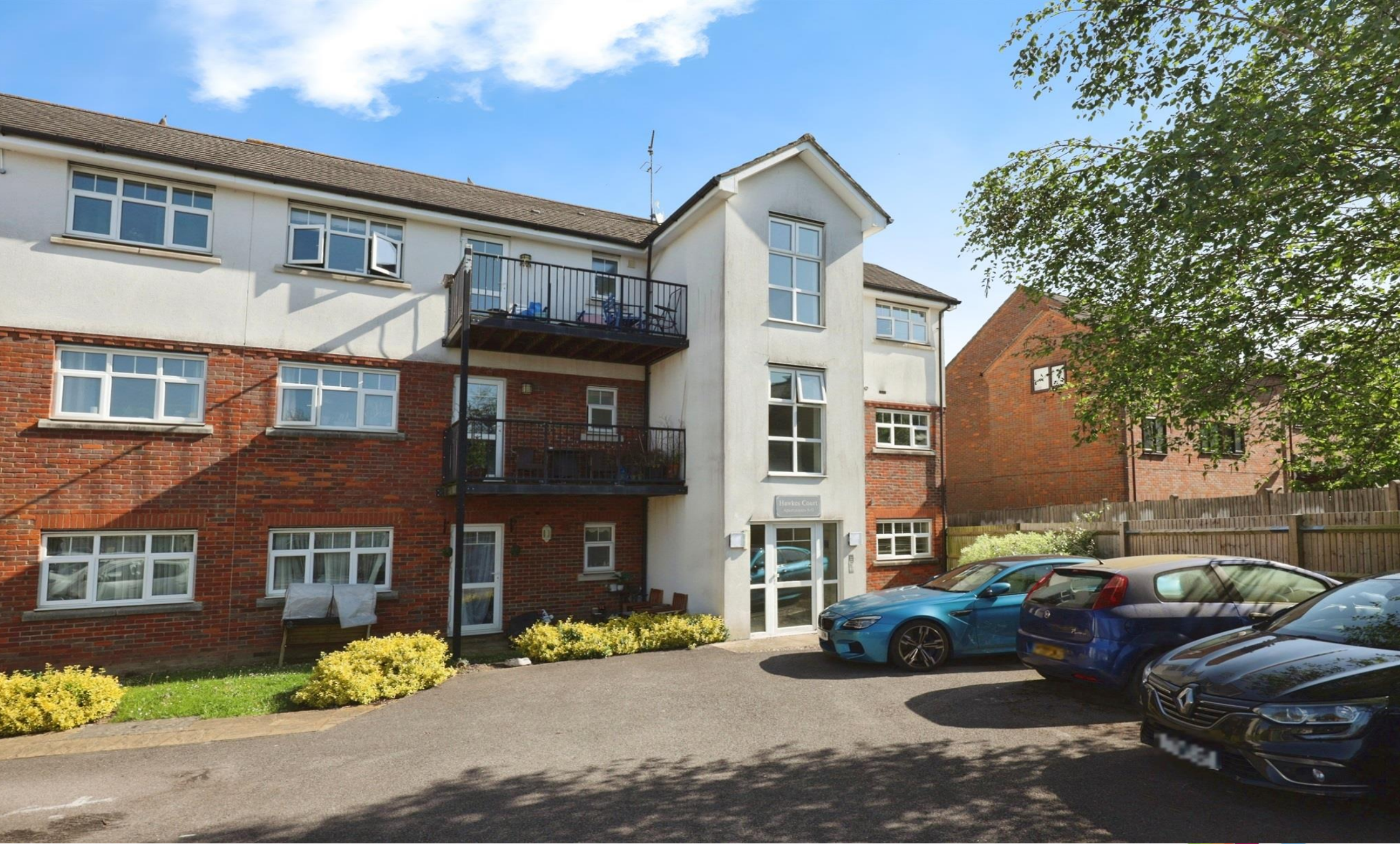
Hawkes Court, Cameron Road Chesham HP5 3AW