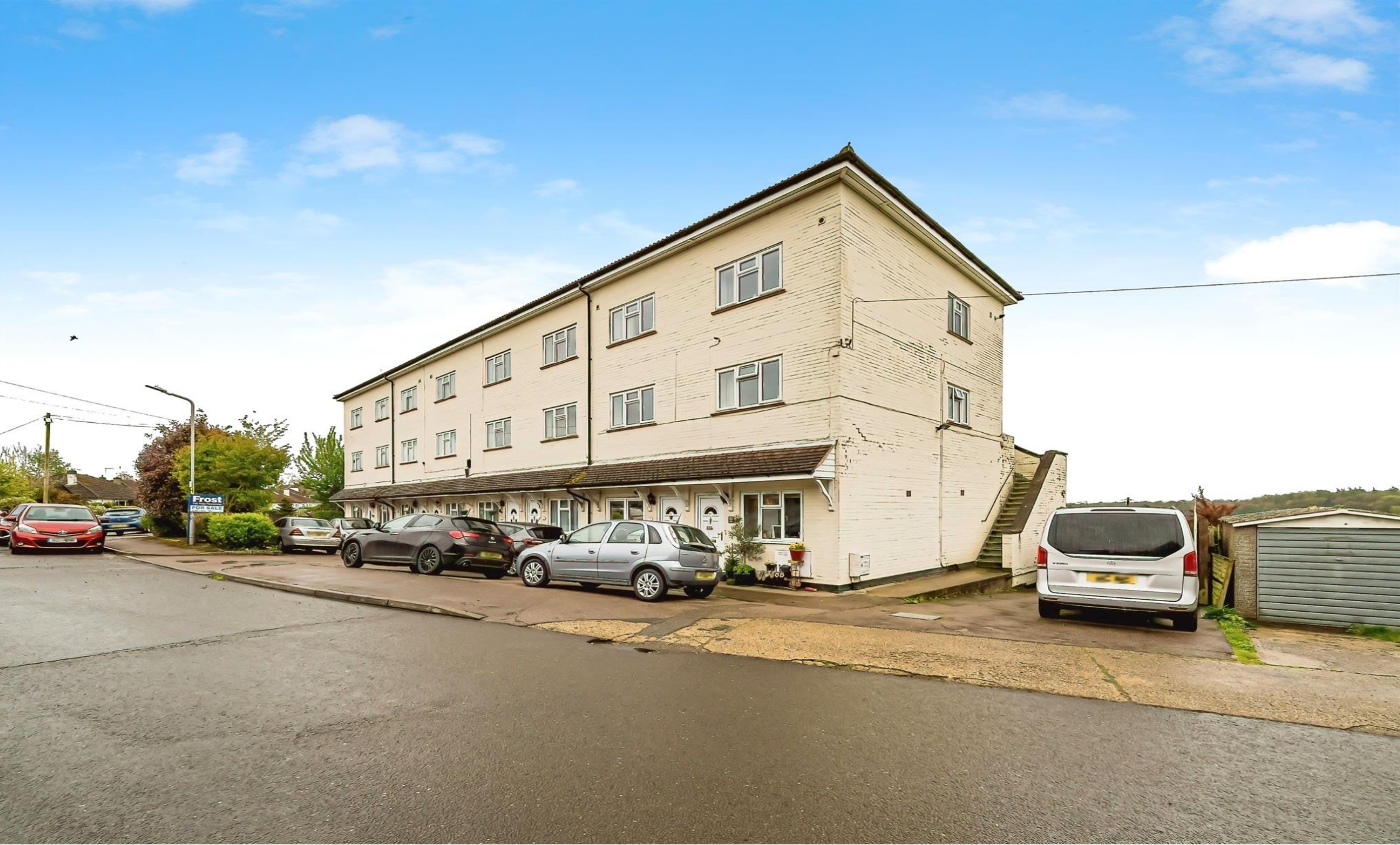
Rose Court, Chessmount Rise, Chesham HP5 1RJ