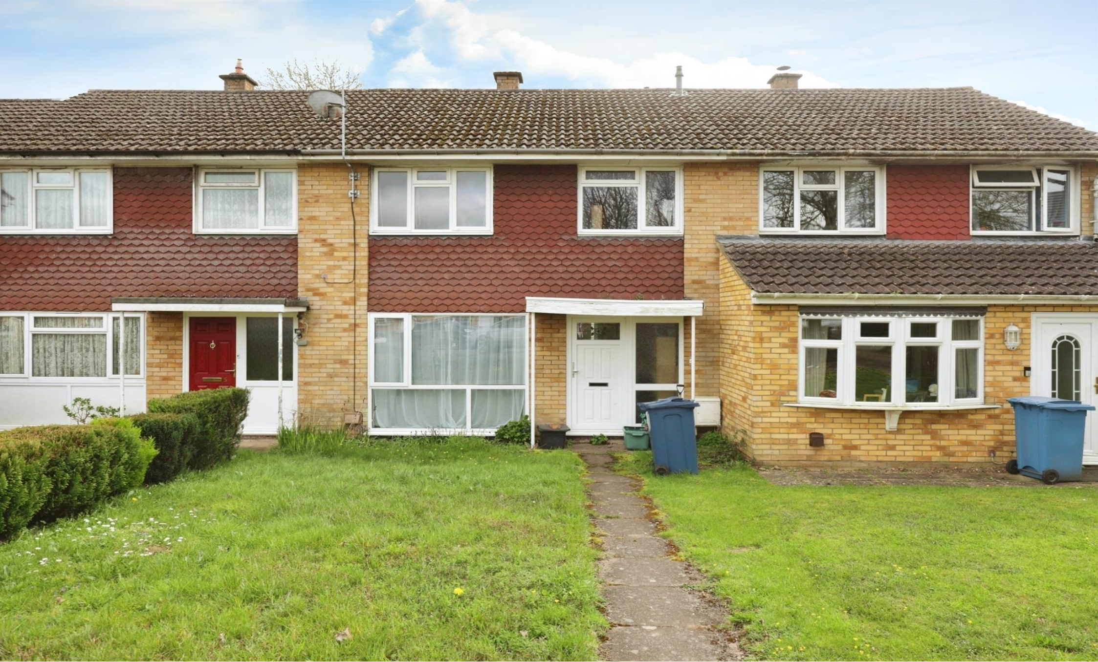
Little Hivings, Chesham HP5 2NA