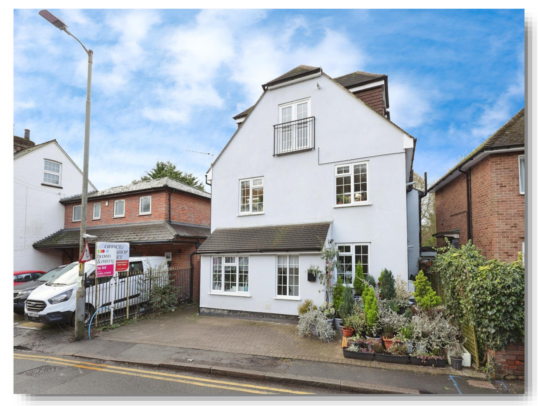
The Old Brewery Waterside, CheshamHP5 1PE