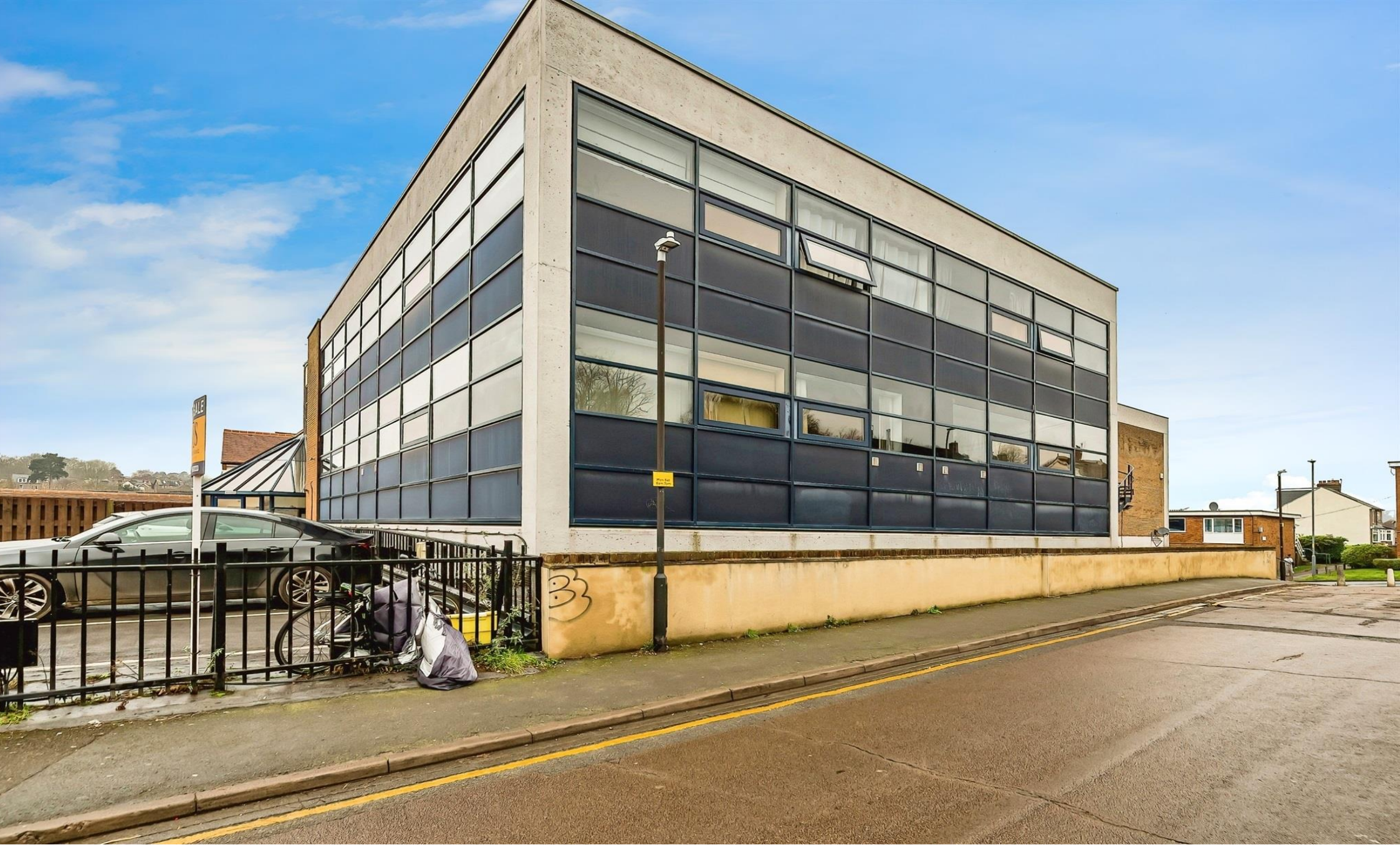
Media House The Backs, Chesham HP5 1DU