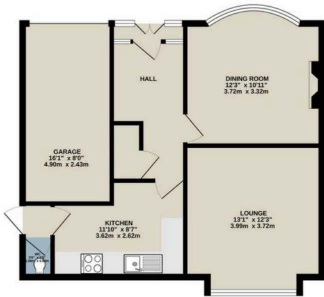
GROUND FLOOR 621 sq.ft. (57.7 sq.m.) approx.