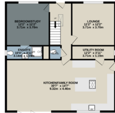
GROUND FLOOR 1123 sq.ft. (104.4 sq.m.) approx.