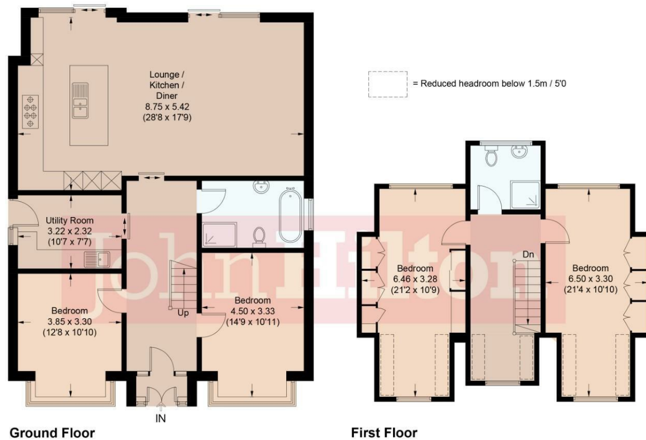
Illustration for identification purposes only, measurements are approximate, not to scale. Imageplansurveys @ 2025