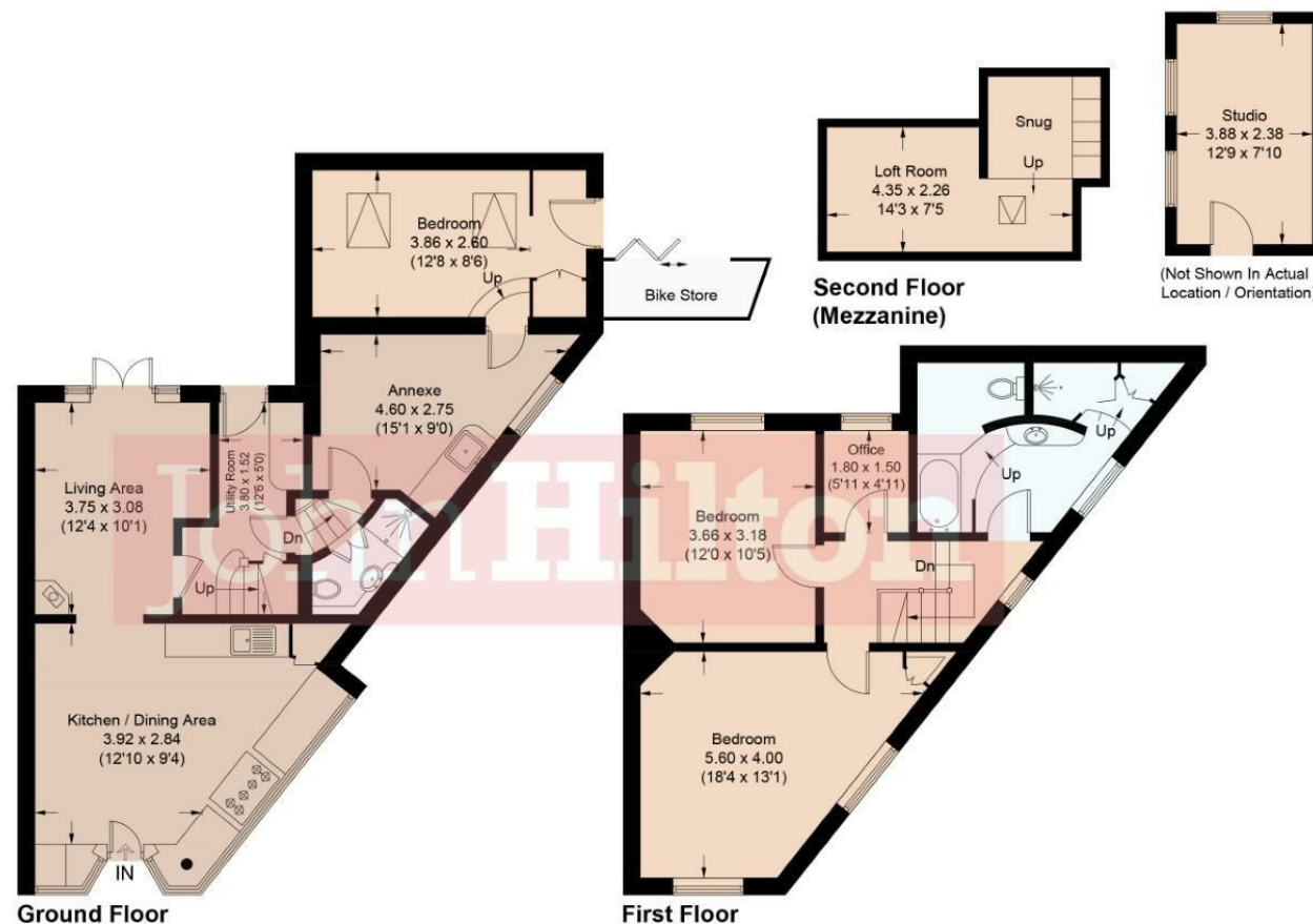
Illustration for identification purposes only, measurements are approximate, not to scale. Imageplansurveys @ 2025